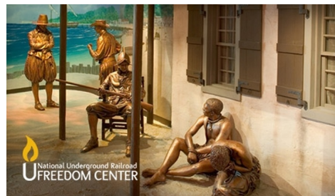
The National Underground Railroad Freedom Center