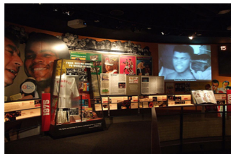
Muhammad Ali Center