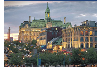
Enjoy a Guided Tour of Montréal