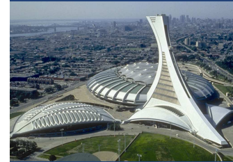
Visit Montréal's Olympic Park

*Price per person, based on double occupancy.