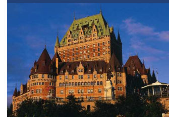
Enjoy a Guided Tour of Québec City

Day 7: Today after enjoying a Continental Breakfast, you depart for home... A perfect time to chat with your friends about all the fun things you've done, the great sights you've seen and where your next group trip will take you!